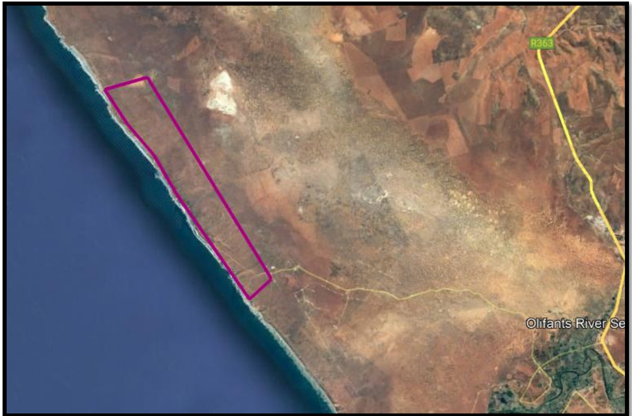
Figure 1: Satellite view of the proposed prospecting right area of Mineral Sands Resources (Pty) Ltd.

During the site inspection, no alien plant species were identified, however the listed invasive species below are examples of species that could occur in the area, namely: