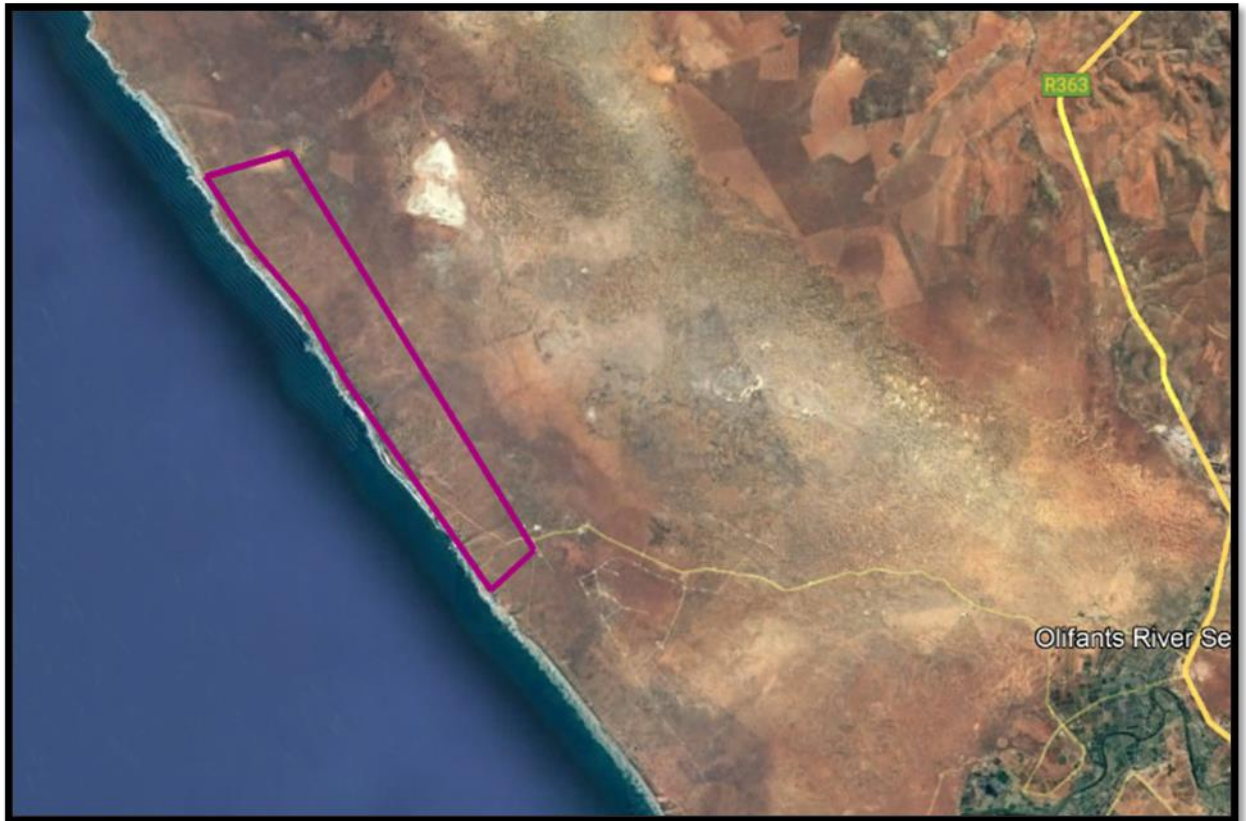
Figure 1: Satellite view of the proposed prospecting right area of Mineral Sands Resources (Pty) Ltd.

During the site inspection, no alien plant species were identified, however the listed invasive species below are examples of species that could occur in the area, namely: