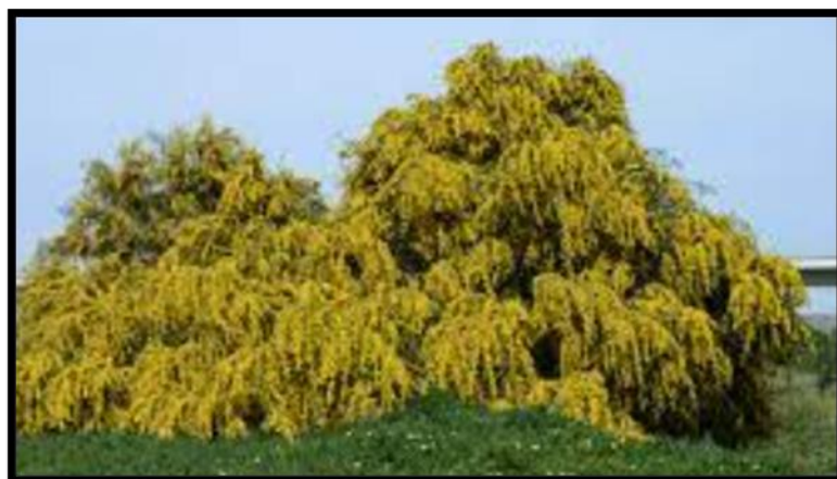
Hakea sericea (Silky hakea)