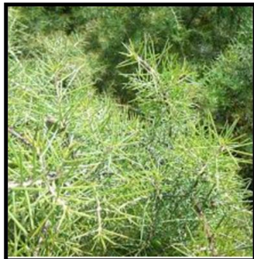
Acacia longifolia (Long-leaved wattle)