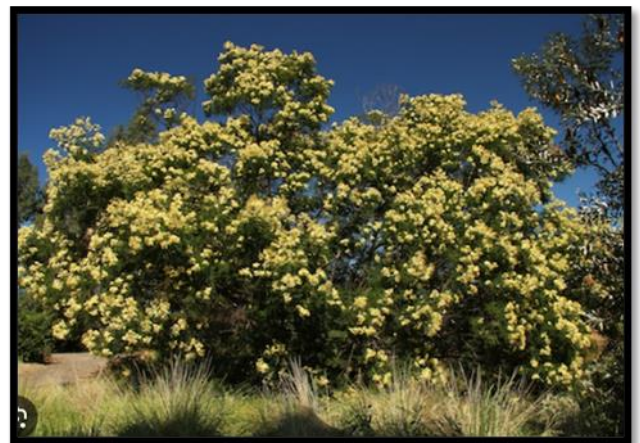
Acacia saligna (Port Jackson)