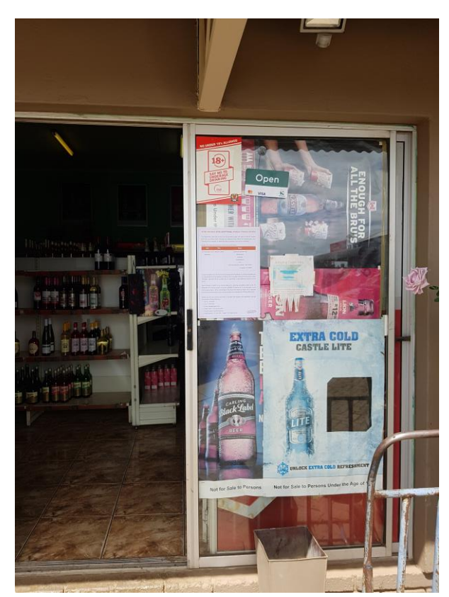
Figure 22: A3 poster (in English) placed at the liquor store around the application area.