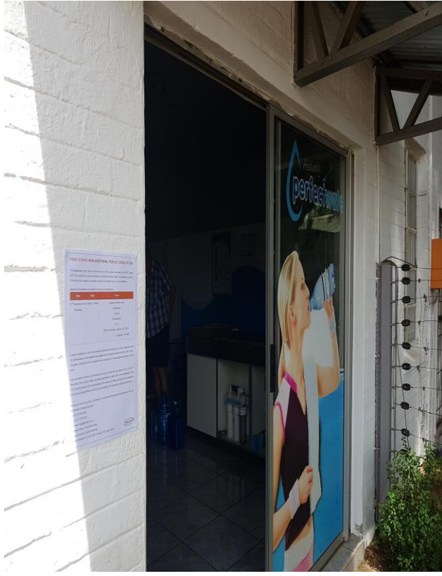
Figure 24: A3 poster (in English) placed at a water store around the application area.