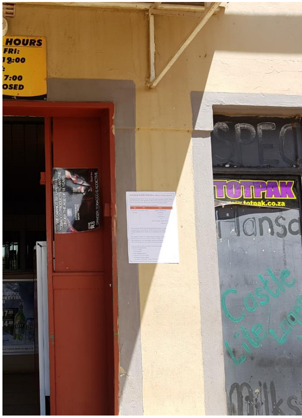
Figure 27: A3 poster (in English) placed at a liquor store around the application area.