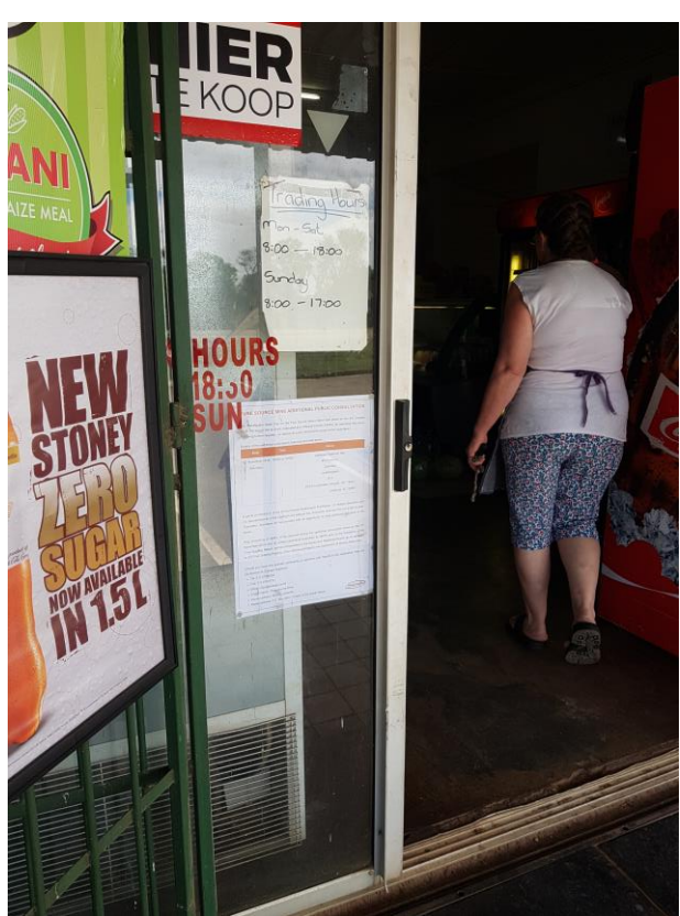
Figure 23: A3 poster (in English) placed at a supermarket around the application area.