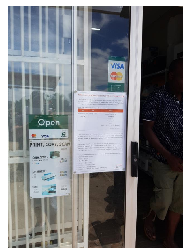
Figure 25: A3 poster (in English) placed at a store around the application area.