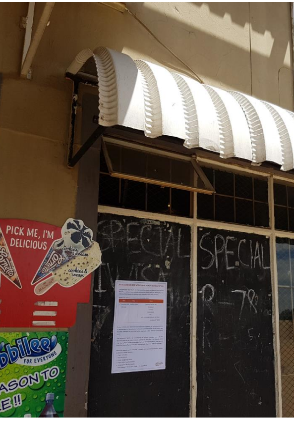
Figure 26: A3 poster (in English) placed at Best Price Supermarket around the application area.