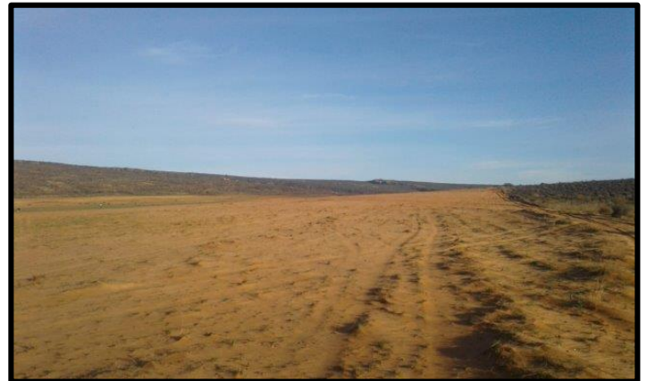
Figure 1: Photographs showing the proposed footprint area that is devoid of natural Leipoldtville sand fynbos.

At the time of the inspection no listed weeds and/or invader plant species were present within the proposed footprint, and the Mesquite trees were the only species of concern noted near the study area.