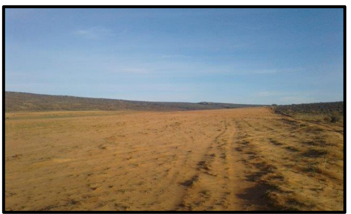
<u>Figure 1</u>: Photographs showing the proposed footprint area that is devoid of natural Leipoldtville sand fynbos.

At the time of the inspection no listed weeds and/or invader plant species were present within the proposed footprint, and the Mesquite trees were the only species of concern noted near the study area.