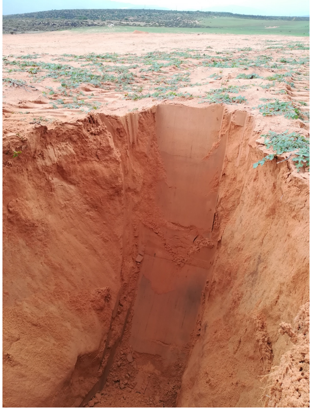
Figure 4. Test pit showing the Clovelly 1100 soil that occurs across the site.