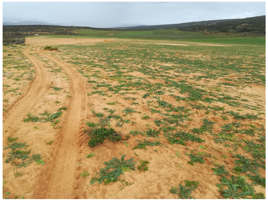
Figure 3. View of typical site conditions, looking in a south easterly direction down the mining area, with one centre pivot in the background.