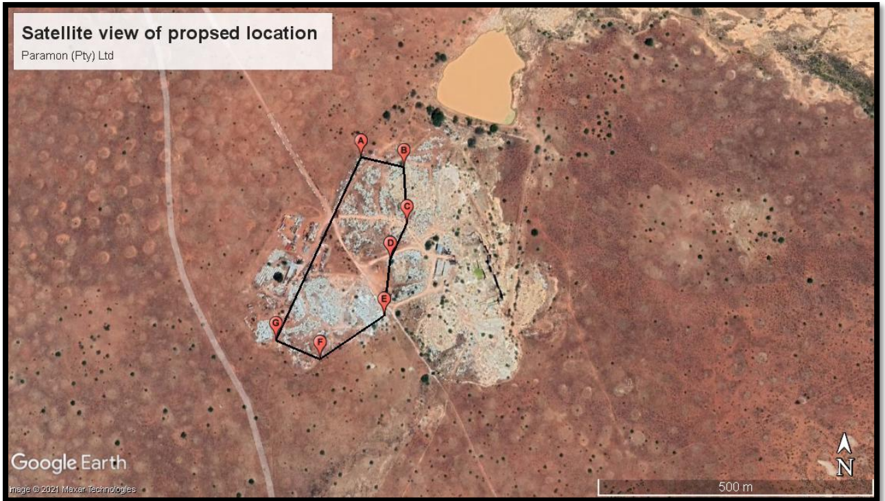
Figure 2: Satellite view of the proposed mining area, where the black polygon indicates the mining boundary.

The following species of concern has been known to likely occur within the mining boundary: