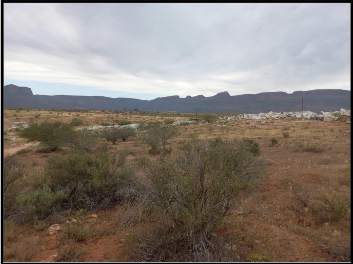
Figure 1: Visual representation of the vegetation inhabiting the Ecological Support Area in Alternative one) Information obtained from (Plant Species and Terrestrial Biodiversity Theme Compliance Statement dated October 2021 compiled by Enviroworks - Figure 9)