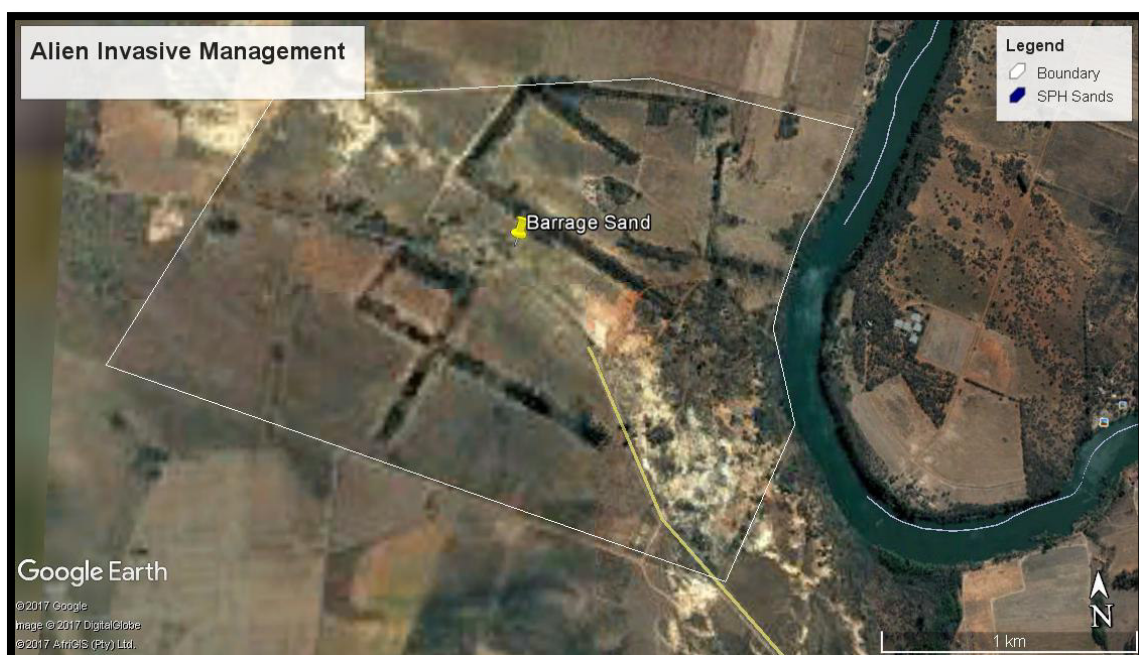
Figure 1: Regional Location of Tja Naledi – Barrage Bulk Sand Mine

Control of invasive plant species and weeds is an important aspect during all phases of the proposed activities. Therefore, an alien invasive management plan was developed for the site to be implemented during the construction/site establishment-, operational-, decommissioning phase and 12 months' aftercare period of the mining activity.