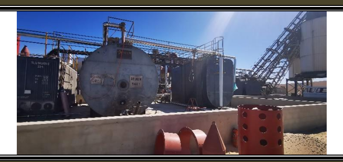
BITUMAN TANK ON CONCRETE FLOOR