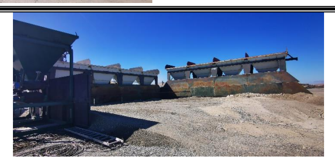
VIEW OF BUNDED AND CONCRETED FLOOR AREAS