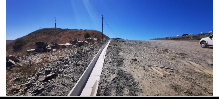
STORMWATER CHANNELS CURRENTLY BEING INSTALLED