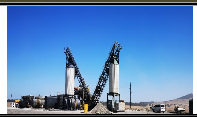
HAZARDOUS AREA – BUNDING WALL TO BE INSTALLED SURROUNDING ENTIRE LAYED WITH CONCRETE FLOOR