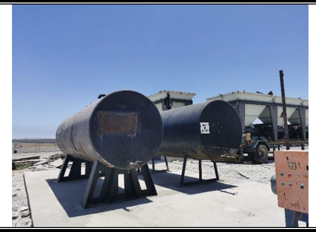
DIESEL AND PARAFIN ON CONCRETE FLOOR WILL BE BUNDED OFF SEPERATELY