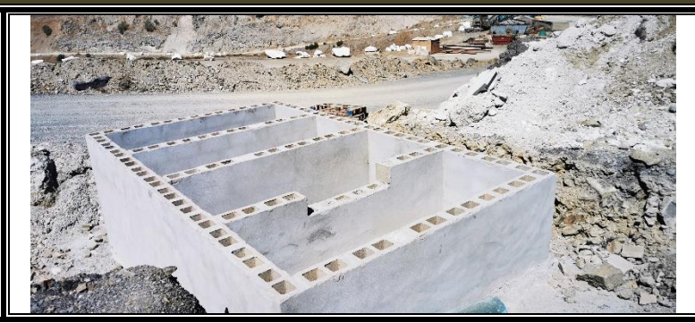
OIL TRAP AREA IN PROCESS