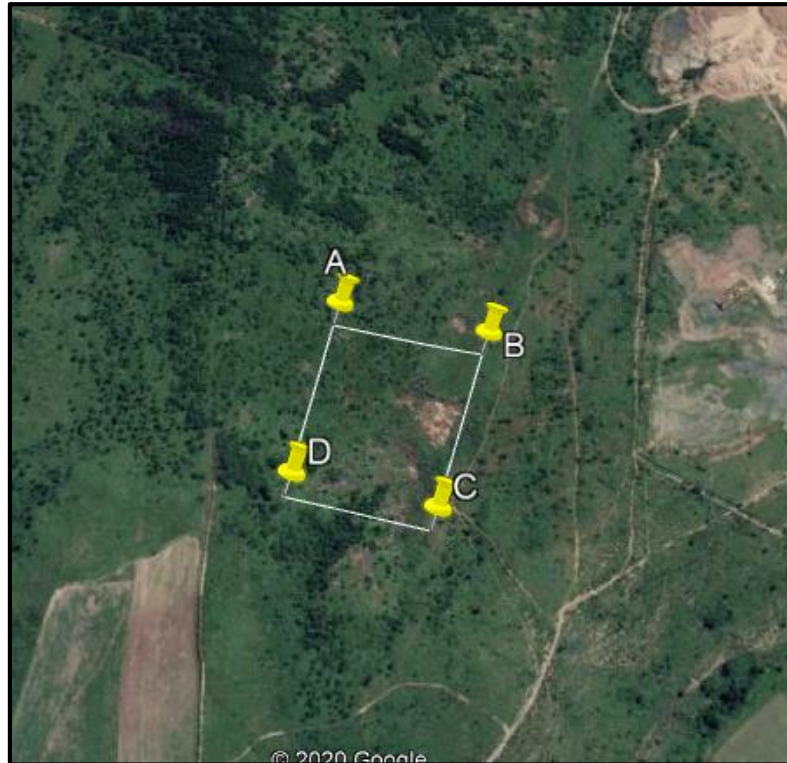
Figure 1: Satellite view showing the location of the mining permit application area (white polygon) in relation to the surrounding area.