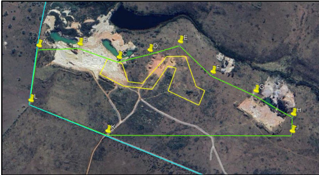
Figure 1: Satellite view showing the location of the proposed mining area (green polygon) in relation to the surrounding landscape where the yellow polygon indicates the Makana Brick mining permit area, and the blue lines show the boundary of Portion 3 of The Orchards No 233.

Should the relevant authorisations be granted, and the proposed mining be allowed, the project will comprise of activities that can be divided into three key phases (discussed in more detail below) namely the: