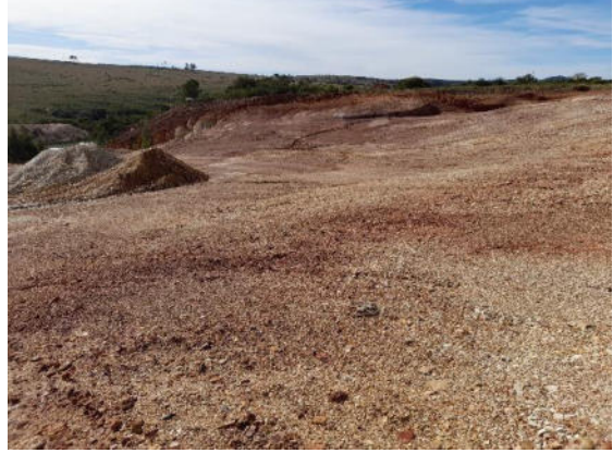
Mining area (north-eastern view).