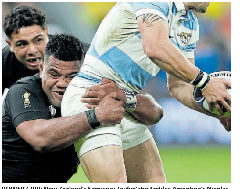
POWER GRIP: New Zealand's Samisoni Taukei'aho tackles Argentina's Nicolas Sanchez in their Rugby World Cup semifinal.

"We'll be trying to send them off the way they deserve, which is with a victory." Having signed a contract extension to play in New Zealand until 2027, 26-year-old Taukei'aho will continue on, likely to be a big part of Scott Robertson's plans