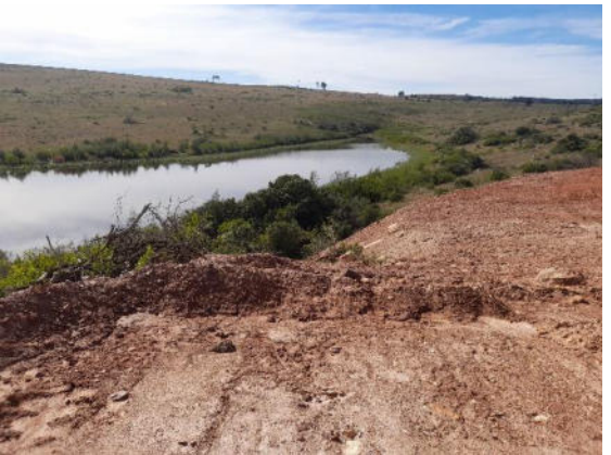
View of the Botha's River and dam (northern view).