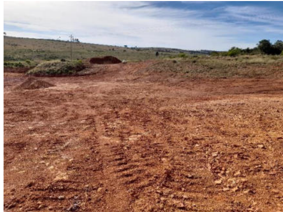
Pictures of one of the areas where clay has been recovered (northern view).