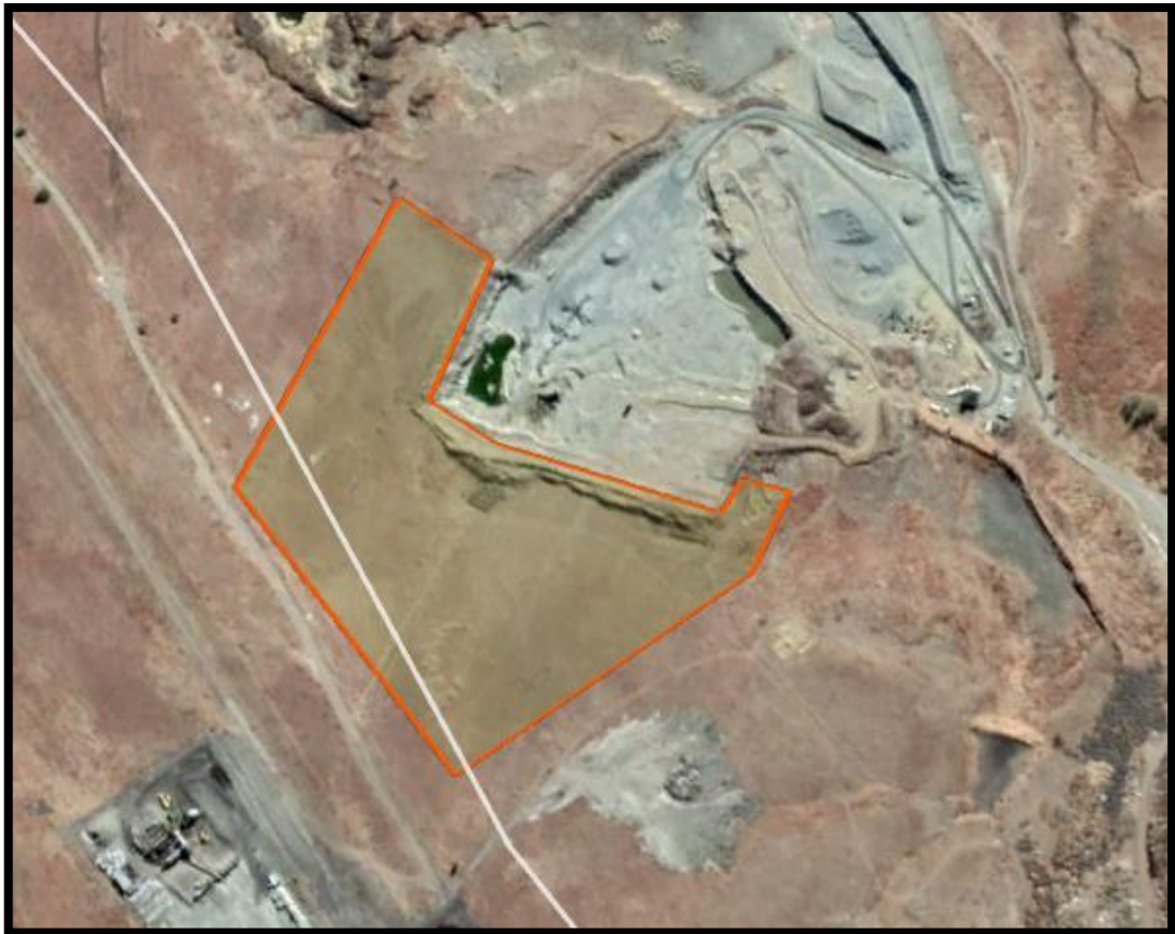
Figure 1: Satellite view showing the location of the mining permit application area (orange polygon) in relation to the surrounding area.