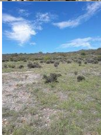
OLD QUARRY PIT AREA