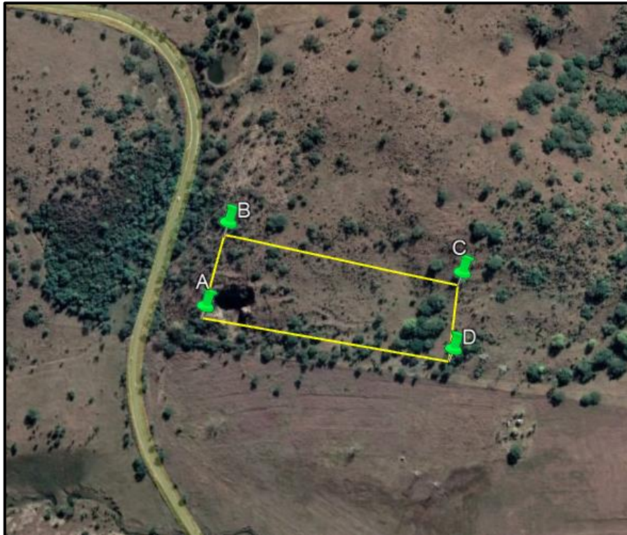
Figure 1: Satellite view showing the location of the mining permit application area (yellow polygon) in relation to the surrounding area.