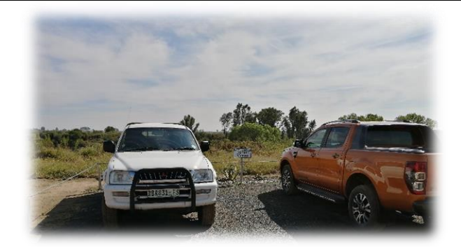
SAND MINE (QUARRY)